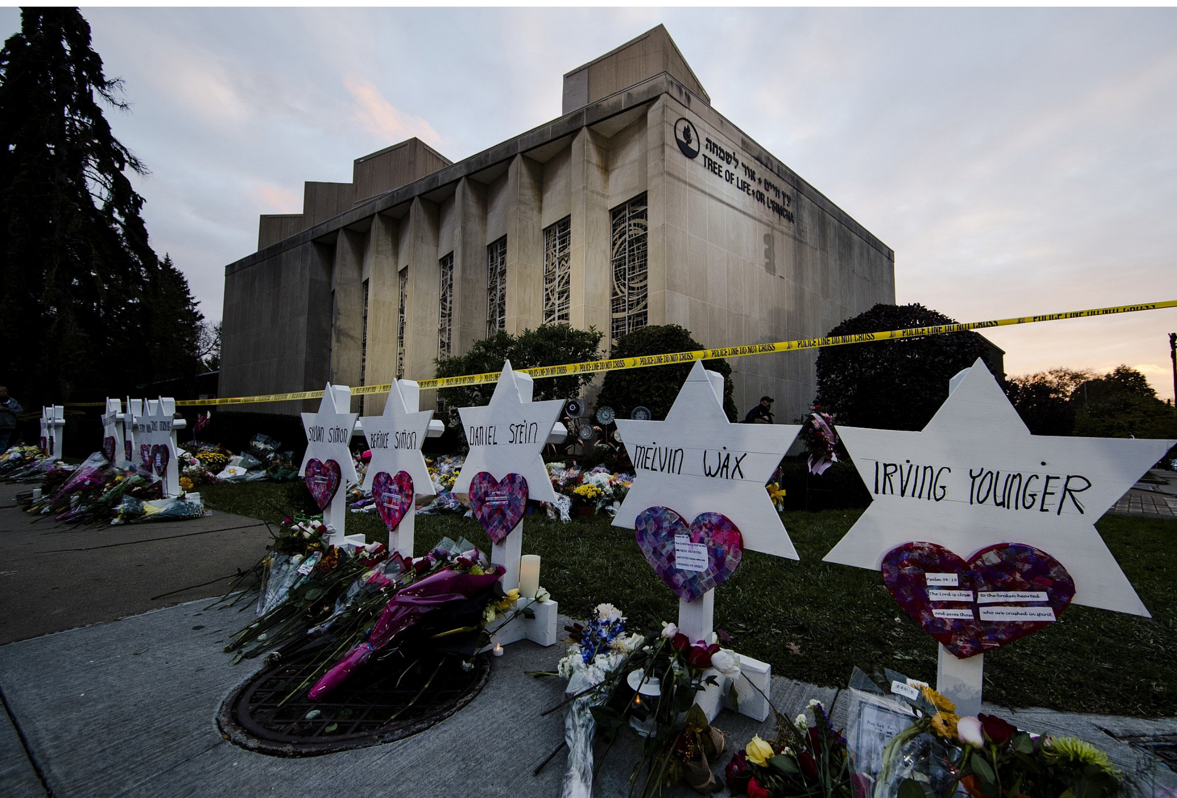
TREE OF LIFE SYNAGOGUE: THE DEADLIEST ANTI-SEMITIC ATTACK IN THE UNITED STATES

WATCH TOP TEN VIDEO HERE: https://youtu.be/a6tOsst4RLQ