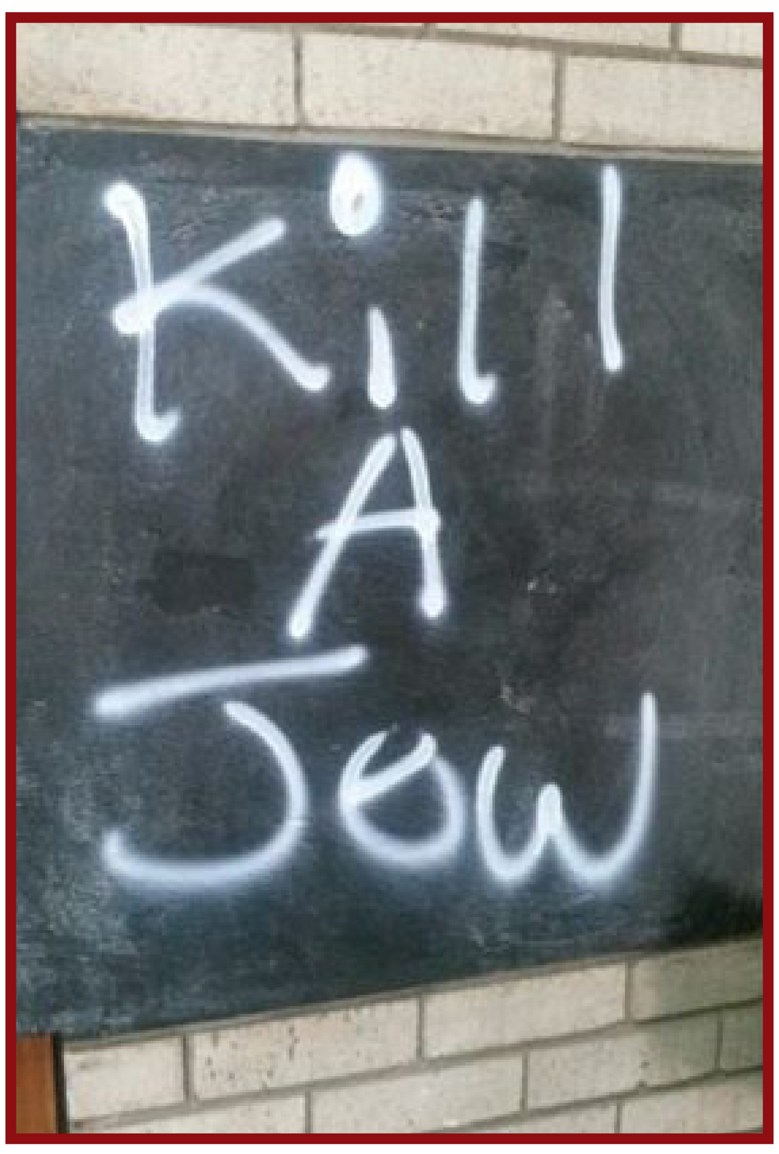
UNIVERSITY OF WITWATERSRAND, SOUTH AFRICA 2016