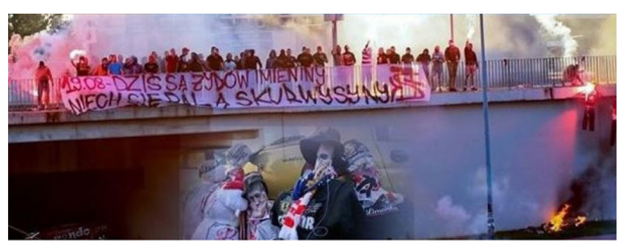
"19.08, today the Jews got a name. "Let them burn, motherfu**ers."

• UNITED STATES - Between 50 to 75 students from Catholic Memorial School in Newton, Massachusetts stunned spectators in March during a basketball game with Newton North High School, when they shouted, "You killed Jesus, you killed Jesus" at their opponents. Newton North High has many Jewish students. Students were later forced to apologize to North High's principal and were criticized in a statement by the Boston Archdiocese. Meanwhile, officials at Keefe Regional Technical School and Marian