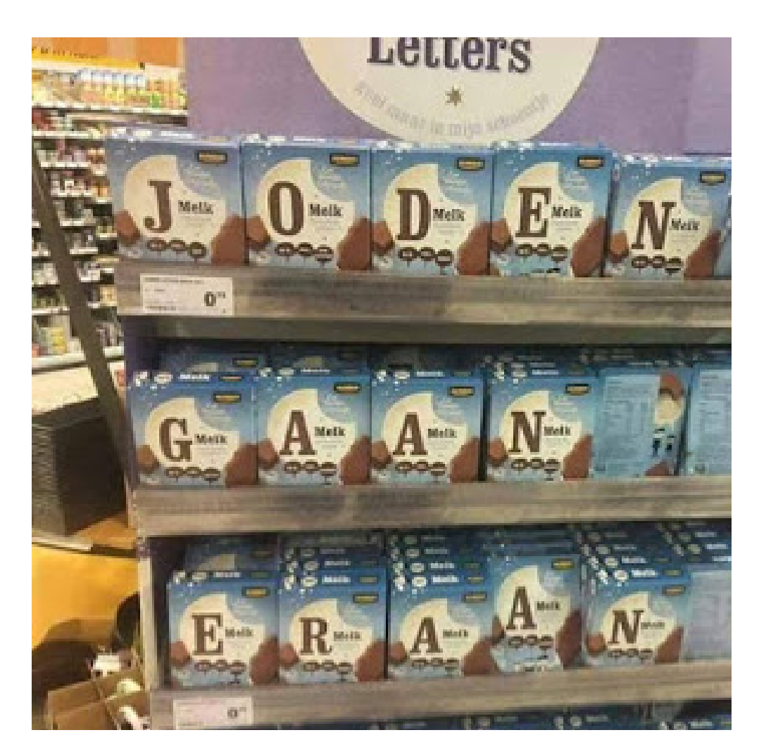
'JEWS WILL BE FINISHED'

However, a trend of anti-Semitic incidents in Dutch schools has become particularly worrisome. In June, high school students at a graduation party in the town of Schijndel sang about burning Jews. As they entered the hall, some of the graduates broke out in song with the lyrics, "Together we'll burn Jews, because Jews burn the best"- a chant sometimes heard in the country's soccer stadiums (see #9).