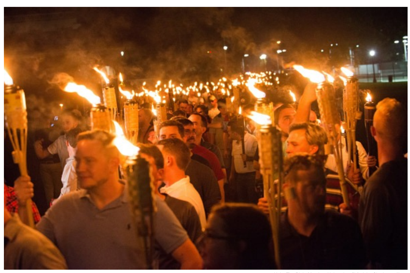
Unite The Right March at University of Virginia, Charlottesville